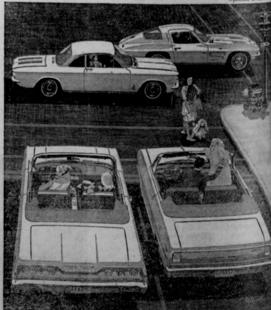
Top—Corvette Sting Ray Sport Coupe and Corvair Monza Spyder Club Coupe. Below—left, Chevrolet Impala SS Convertible; right, Chevy II Nova 100 SS Convertible. (All four available in both convertible and coupe models. Super Sport and Spyder equipment optional at extra cost.)

See four entirely different kinds of cars at your Chevrolet dealer's Showroom