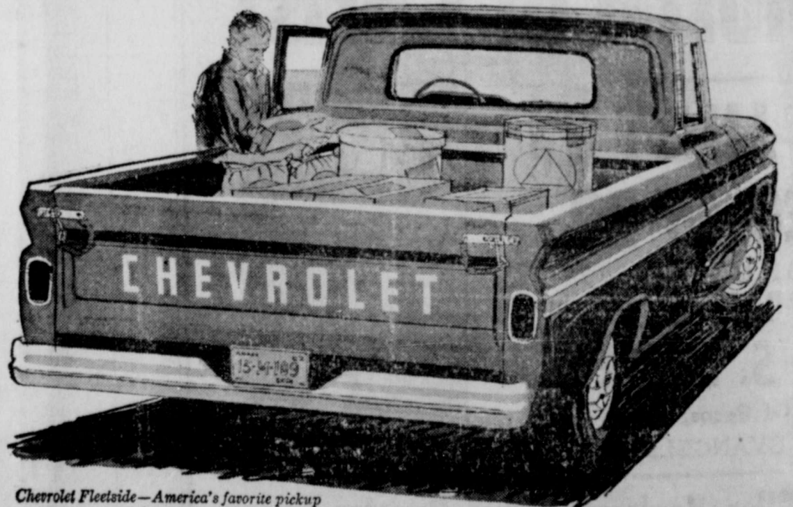
Chevrolet Fleetside—America's favorite pickup

If you wish you had a truck that cost you less thought and attention, put your money on quality. Make your next buy a dependable Chevrolet truck.