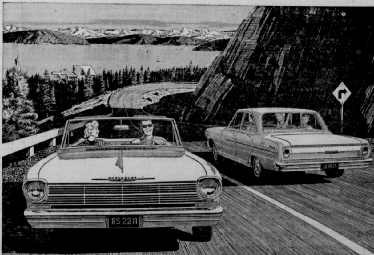
The sporty Chevy II Nova Convertible and sprightly 4-Door Sedan

See the new Chevy II at your local authorized Chevrolet dealer's