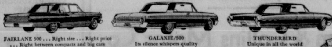
FAIRLANE 500 . . . Right size . . . Right price . . . Right between compacts and big cars

Whatever you're looking for in a V-8, look to the long Ford line