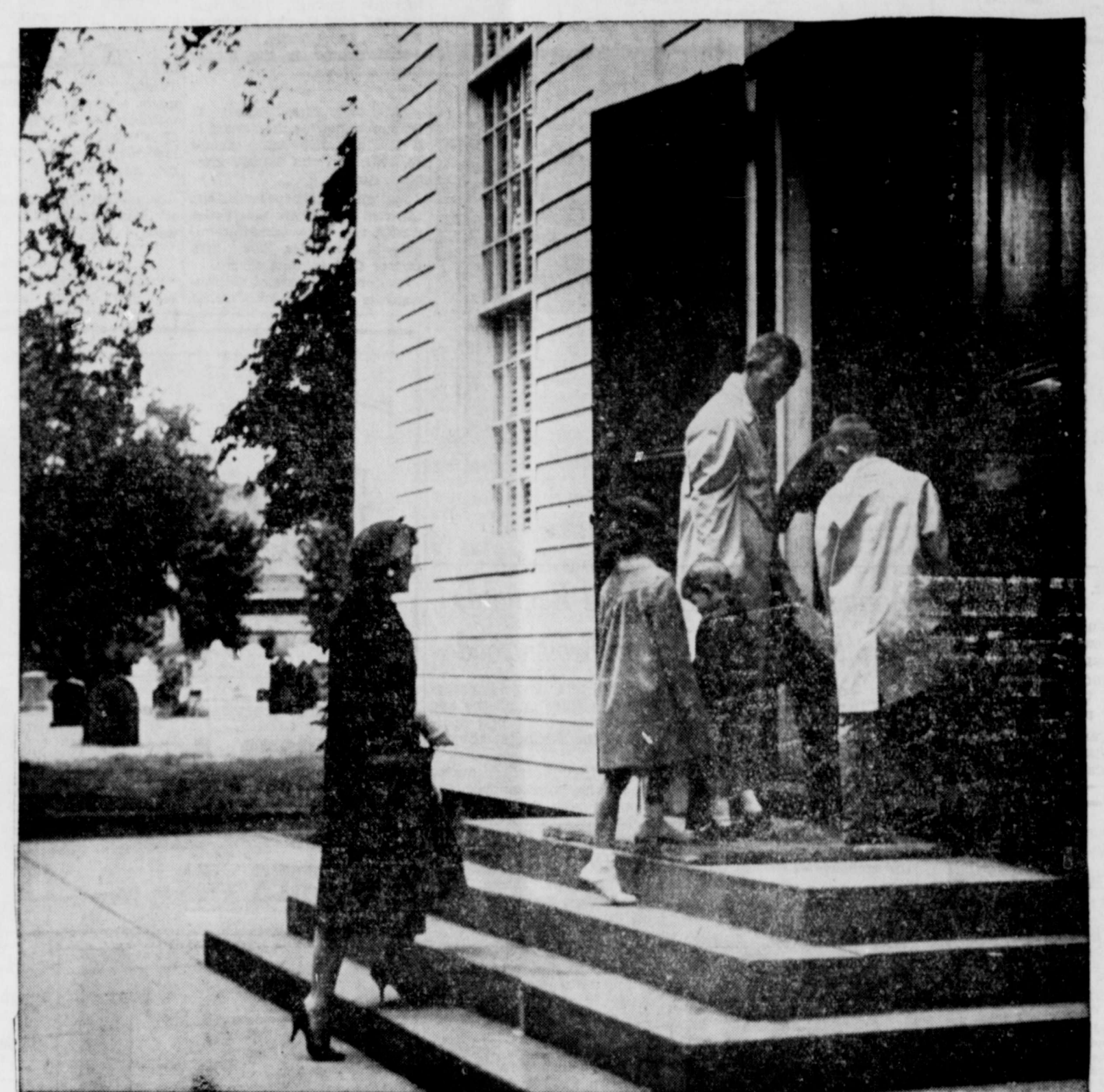
Walk in-life looks better when you walk out

Follow the leader ... In the ever- rings of teen-age independence, have dismounting bustle and turmoil of modern living it is increasingly difficult for many families to set aside even a few minutes each day when they can all be together-conscious of each other as individuals and as a family. We're living in the "pressure decade."