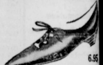
Black Leather Flat 6.95