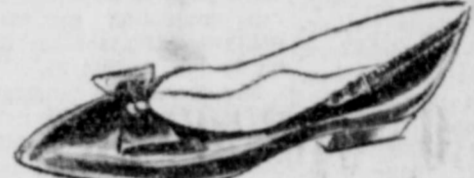
Black Patent or Velvet Slipper With Swivel Strap and Bow 4.95