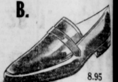
B. Strap trim leather casual 8.95