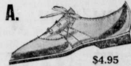
A. Girls' Saddle Classic $4.95