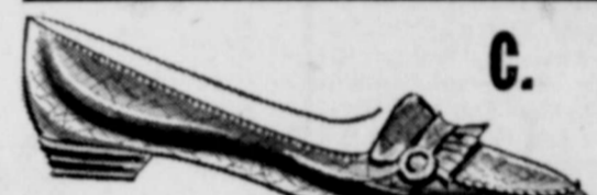
C. Tailored Walker in Jaunty Otter 5.95