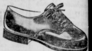
Reinforced tip oxford 4.95