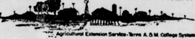
Agricultural Extension Service—Texas A & M College System