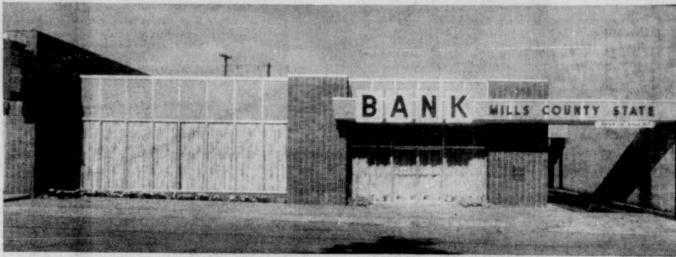
NEW BANK HOME IN QUIET OF MORNING - Here is the new home of Mills County State Bank, Goldthwaite, as it appears in the quiet hours of early morning before the bustling activities of the business day get underway. The new home was officially opened on Sunday, June 11, with a record open house attendance of 2,000 persons.

a good grain crop with most of during the first five months of it harvested before the rains 1959 was 6.57 inches while in 1958 the same period measured The long term normal annual 12.40 and in 1957, 21.23 inches. than in 1957 was 1919.