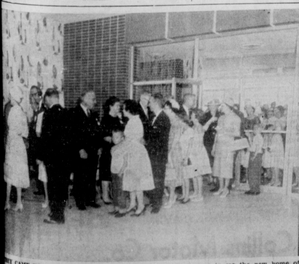
CAME TO SEE IT Some of the capacity crowd that came to see the new home of State Bank are shown here as they entered the building immediately after ribbon ing, calf riding, trailer race, ies. They are being greeted by bank officials just inside the building entrance. | goat sacking and steer riding.

open house sale was a huge success with attendance beyond