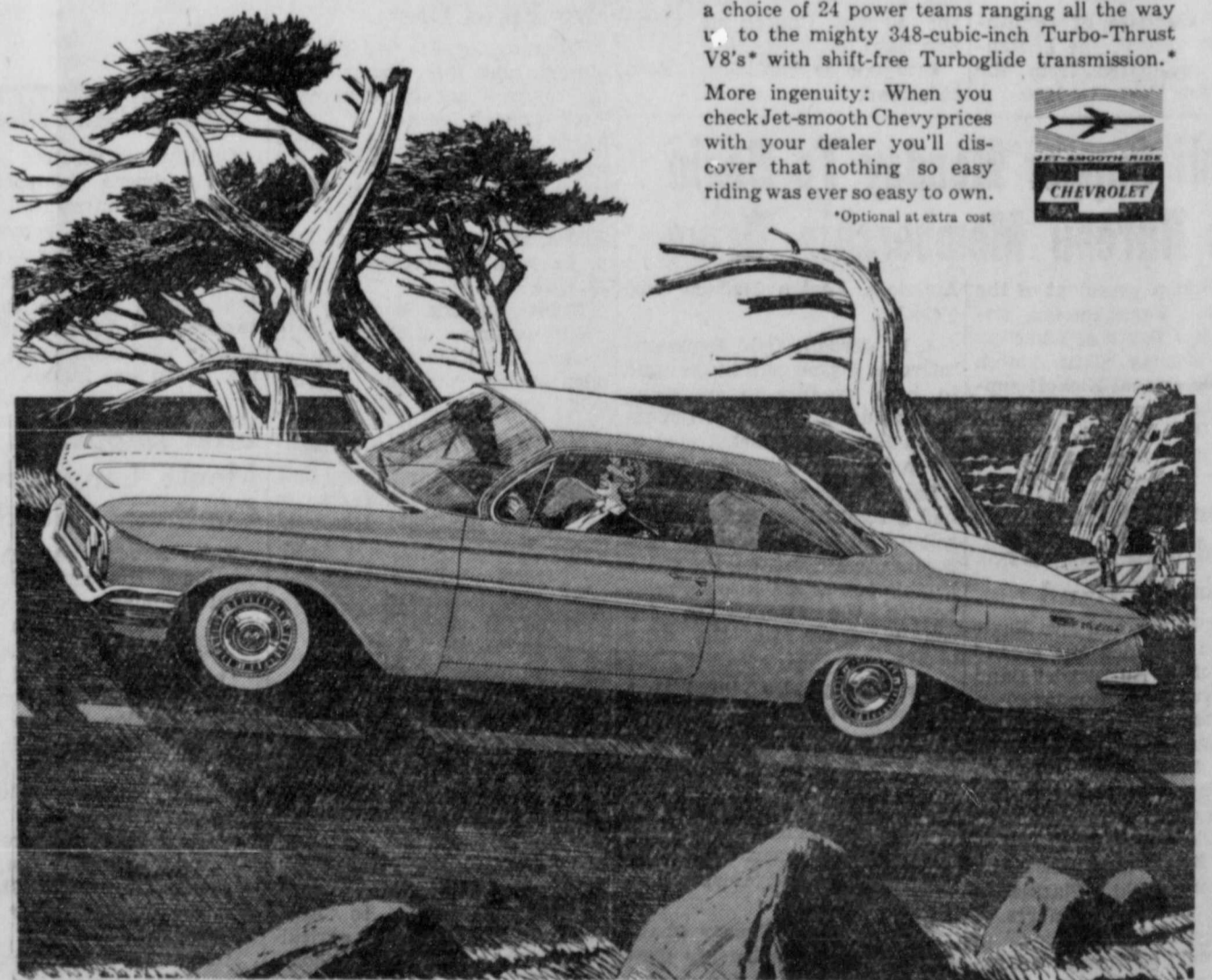
Del Air Sport Coupe—one of 20 Jet-smooth beauties awaiting your pleasure at your Chevy dealer's

Chevy gentles rough roads with a Jet-smooth ride