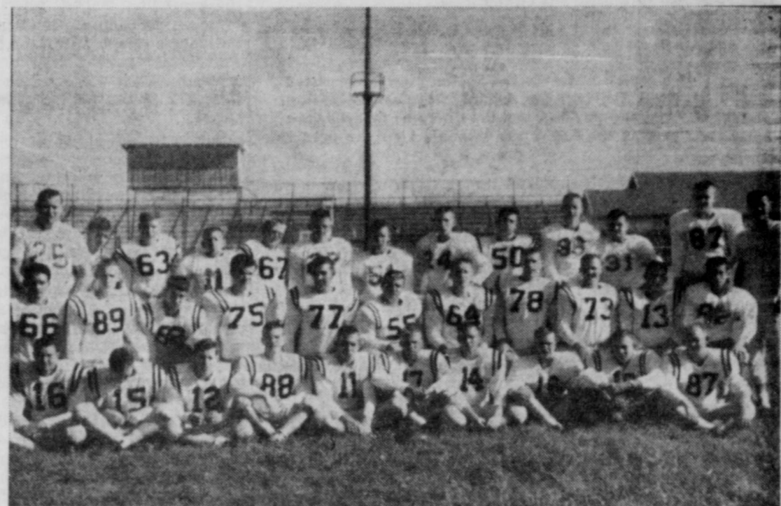
EAGLE SQUAD, COACHES AND MANAGER —Here are members of the 1960 Goldthwaite High School Eagle squad, their coaches and manager. The Eagles will see action Friday night as they play host to the Hamilton Bulldogs on Eagle Field. Game time is 8:00 p. m.