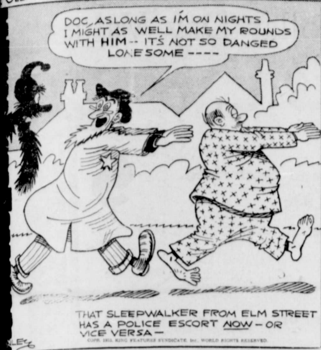
THAT SLEEPWALKER FROM ELM STREET HAS A POLICE ESCORT NOW—OR VICE VERSA—