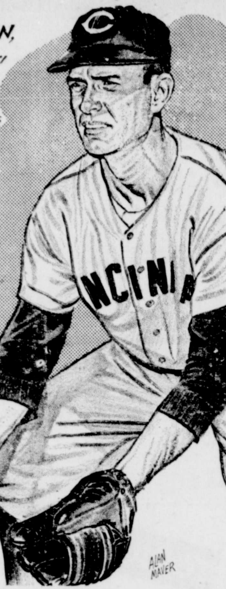
Distributed by Kuo Features Syndicate