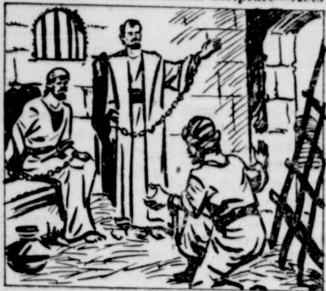
In Philippi Paul and Silas were beaten and thrown into prison. An earthquake broke open the prison doors. The keeper knelt at the disciples' feet in thanksgiving when he found no one had escaped.