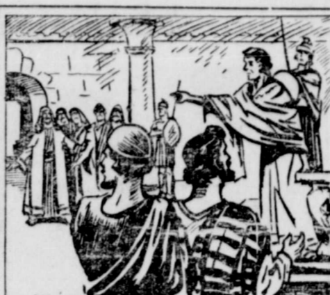
In Corinth Paul spoke boldly. Enemies seized him and took him before the Roman ruler, Gallio, who told the Jews that their religious differences were not in his province, and drove them out. MEMORY VERSE—1 Corinthians 9:12.

couple will make their home after a wedding trip to Galveston.