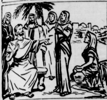
On his second missionary journey Paul went to Philippi, Greece, carrying the gospel to Europe. As there was no synagogue, he sought the river bank where Jews worshiped. A rich woman, Lydia, was converted there.