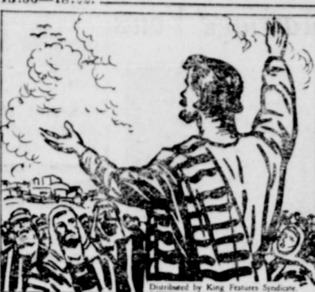
Journeying to Athens, certain philosophers asked to hear about the new gospel. They took Paul to Mars Hill, where he, noting that they had built an altar to "The Unknown God," explained the gospel to them.