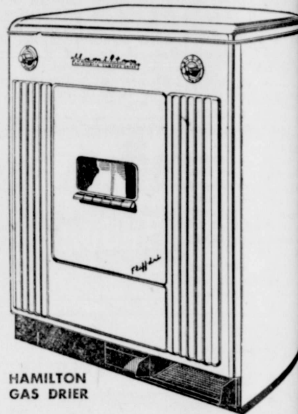
HAMILTON GAS DRIER