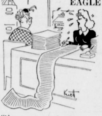
"Now are you sure that this covers everything that happened at Your weekly garden party?"