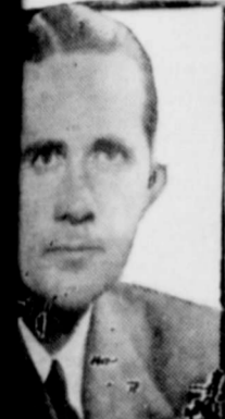
LAN SHIVERS ... Governor ... county vote: Shivers ... 284.

... returns from ... show the fol- ... won their races ... Democratic pri-