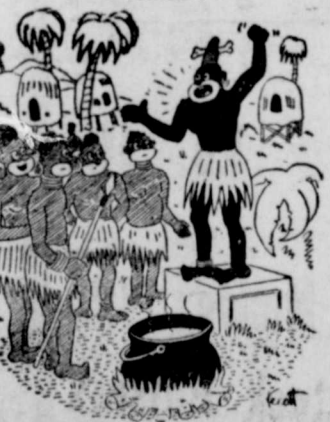
"He's been making speeches constantly ever since he ate that Union Organizer."

ANOTHER PICTURE— The Old Man had to think mighty hard for something to draw for a picture this week, but thought he would offer a solution to a problem that seems to be worrying lots of people right now. Why not send them to Africa, or summers: