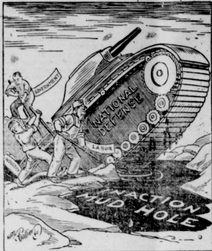
Read Editorial—"Let's Do or Don't."