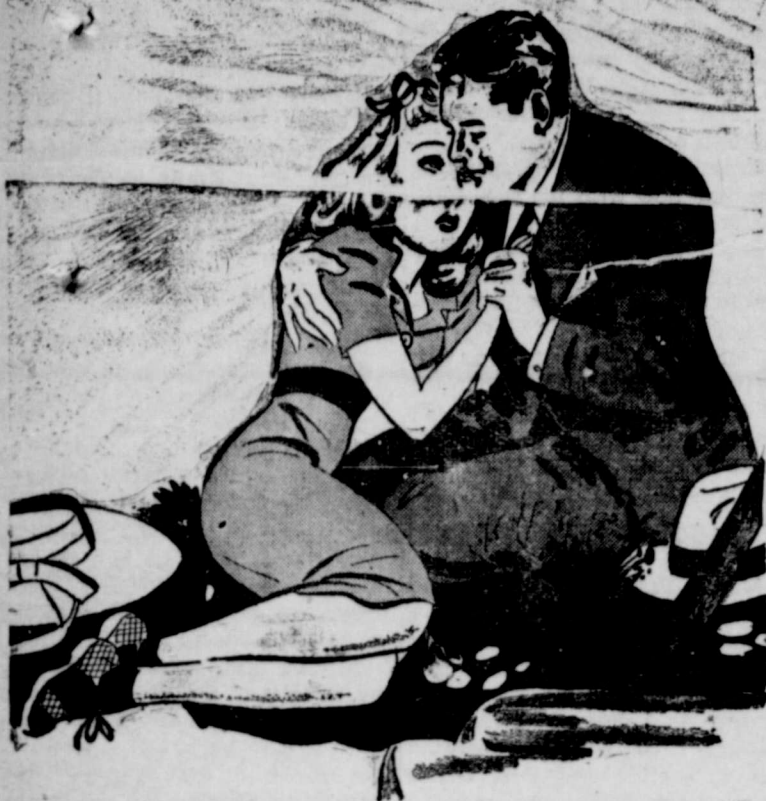
Our girls of 18 and our boys of 21 are bound to fall in love.