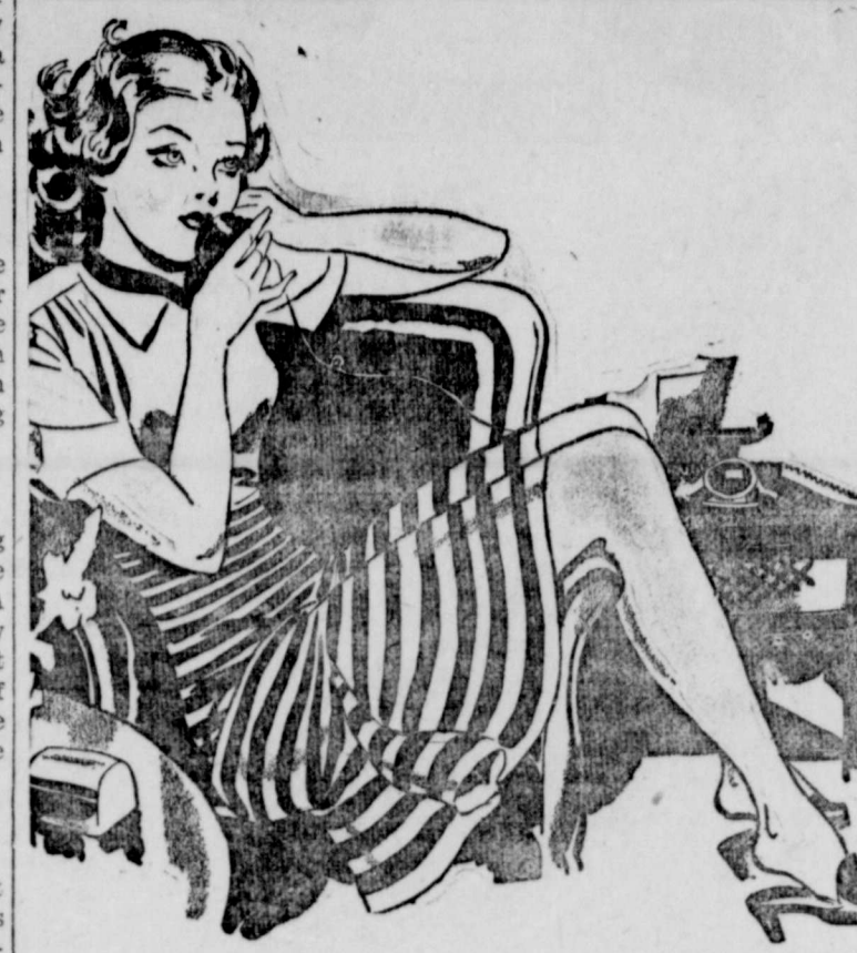
When she answers the phone, Mother says, "If it's the Brown boy tell him you can go to the movie; and if it's Allan, for pity's sake, don't gush at him.

Hands Off the Men and Women Who .Were Your Children (Bell Syndicate-WNU Service.)