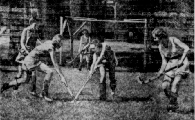
The many school activities offer countless opportunities for snapping pictures that you will enjoy in years to come.

If there was ever a snapshooter's little care you can make even the attend it. It may be a one-room tirely satisfactory pictures. school or it may be a great university. Wherever, whatever it may picture possibilities.