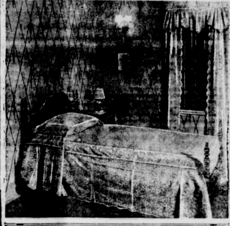
Drapes and Bed Spread that Match

drapes and spreads are vat dyed and hence both sunfast and tub in keeping with the simplicity fast as well, and are very Tective the early American flower past