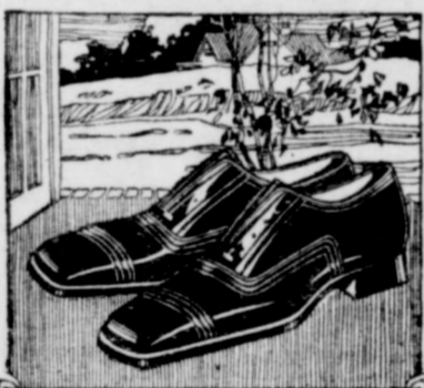
THE FLORSHEIM SHOE

Our shoe business is big because men liked their first pair of Florsheims and came again.