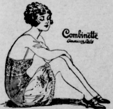
American Lady Corsets Fashionably boned with Mightybone

We carry the best line of work clothing on the market Let us show you our "Buck Overalls"