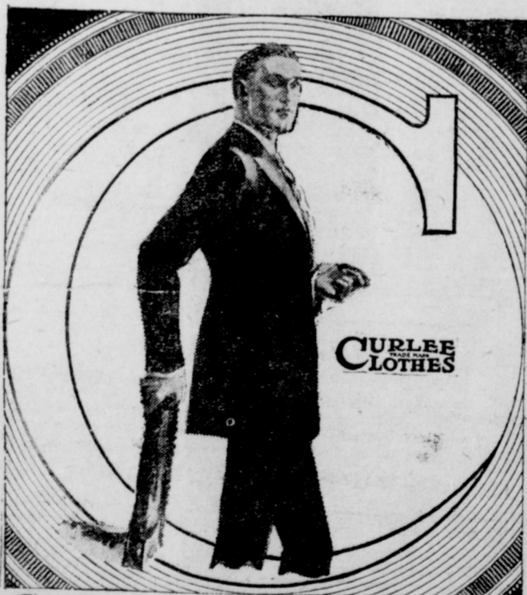
Get in the Well Dressed Circle