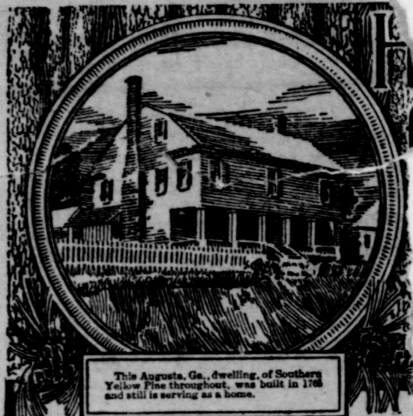
This Augusta, Ga., dwelling, of Southern Yellow Pine throughout, was built in 1708 and still is serving as a home.

WHEN you build a home, build build for a hundred years. One material combines durability and economy is