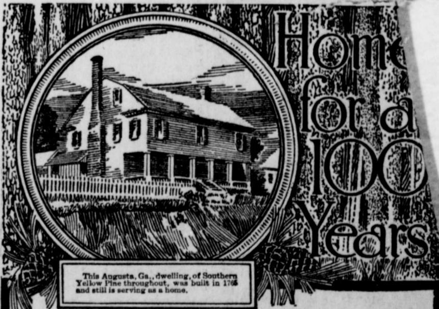
This Augusta, Ga., dwelling, of Southern Yellow Pine throughout, was built in 1788 and still is serving as a home.