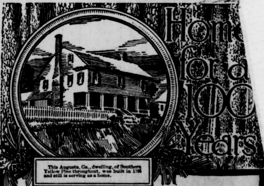
This Augusta, Ga., dwelling of Southern Yellow Pine throughout, was built in 1768 and still is serving as a home.