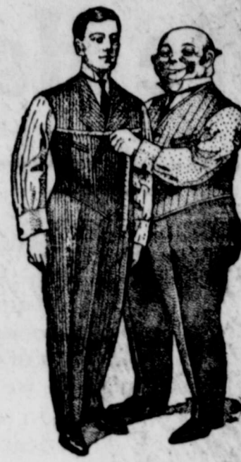
Copyright 1916 Ed. V. Price & Co.