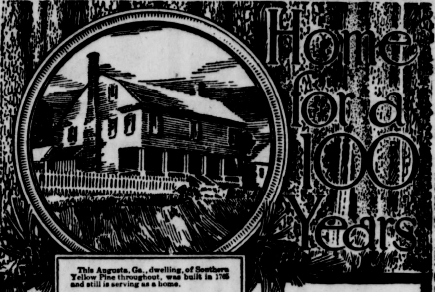
This Augusta, Ga., dwelling of Southern Yellow Pine throughout, was built in 1788 and still is serving as a home.