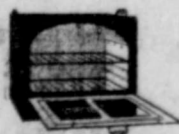
Florence Glass Door Oven, rust proof with arched roof

You can have a slow, simmering fire on one burner and at the same time a quick, hot fire on another. Just set the levers as you want them—and the same heat will be given as long as you wish. All Florence Stoves and Ovens are guaranteed.