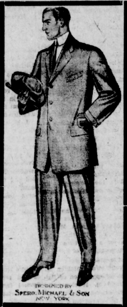
DESIGNED BY SPERO-MICHAEL & SON NEW YORK

We will place on sale (and give 5000 Extra Votes on the Dollar) Men's Dress Shirts and Collars, Work Shirts, Ladies' and Gent.'s Underwear, Trunks and Suit Cases. This is a big line and we confidently look for a good sale on Wednesday and Saturday. We have just received the largest shipment of Dress Shirts ever bought for this market and we believe we have the best values possible for $1.00 and $1.50. Our line of Underwear is large—all new goods bought for this Spring trade—and our Prices are the Lowest. Our Underwear is the celebrated Richelieu line, bought from the factory. The Richelieu brand is a sufficient guarantee. We have a large line of Trunks and Suit Cases and we will give you a Liberal Discount Off on Trunks, as well as Extra Votes.