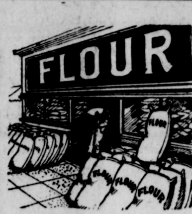
THE SIGN OF GOOD FLOUR

is not a pretty sack or bag, but the improvement in your baking. Try a sack of our GLADIOLA brand and we will not have to urge you to buy a second one. You'll be so well pleased with your better bread, cake, etc., that you wouldn't be without our flour in the house if it cost twice the money.