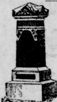
Figure with me when in need of anything in my line. I am in position to save you money on anything in my line. All I ask is a chance. I guarantee my work and will remain here to back my guarantee. See my New Designs before placing an order.