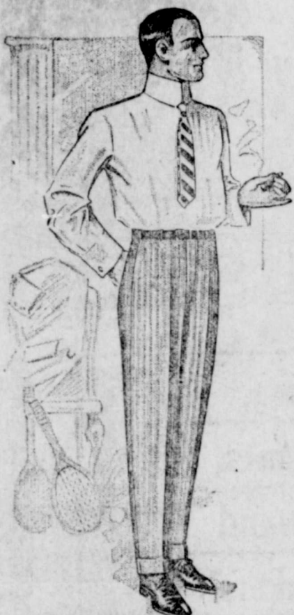
CURLEE $3.50 $5.00 PANTS

"MORE GOODS FOR LESS MONEY; BETTER GOODS FOR THE SAME MONEY"