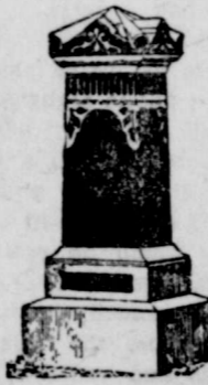
Figure with me when in need of anything in my line. I am in position to save you money on anything in my line. All I ask is a chance. I guarantee my work and will remain here to back my guarantee. See my New Designs before placing an order.