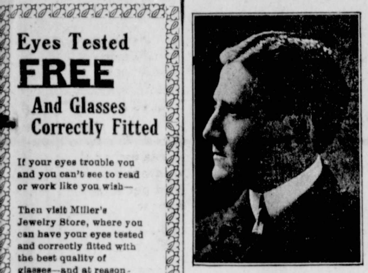
MORRIS SHEPPARD SPEAKS.

Dental Operations pering treatment of Sourvy night.