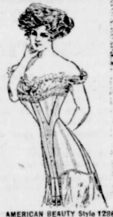
AMERICAN BEAUTY Style 1236 Kalamazoo Corset Co., Makers