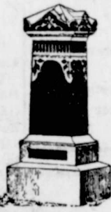
Figure with me when in need of anything in my line. I am in position to save you money on anything in my line. All I ask is a chance. I guarantee my work and will remain here to back my guarantee. See my New Designs before placing an order.