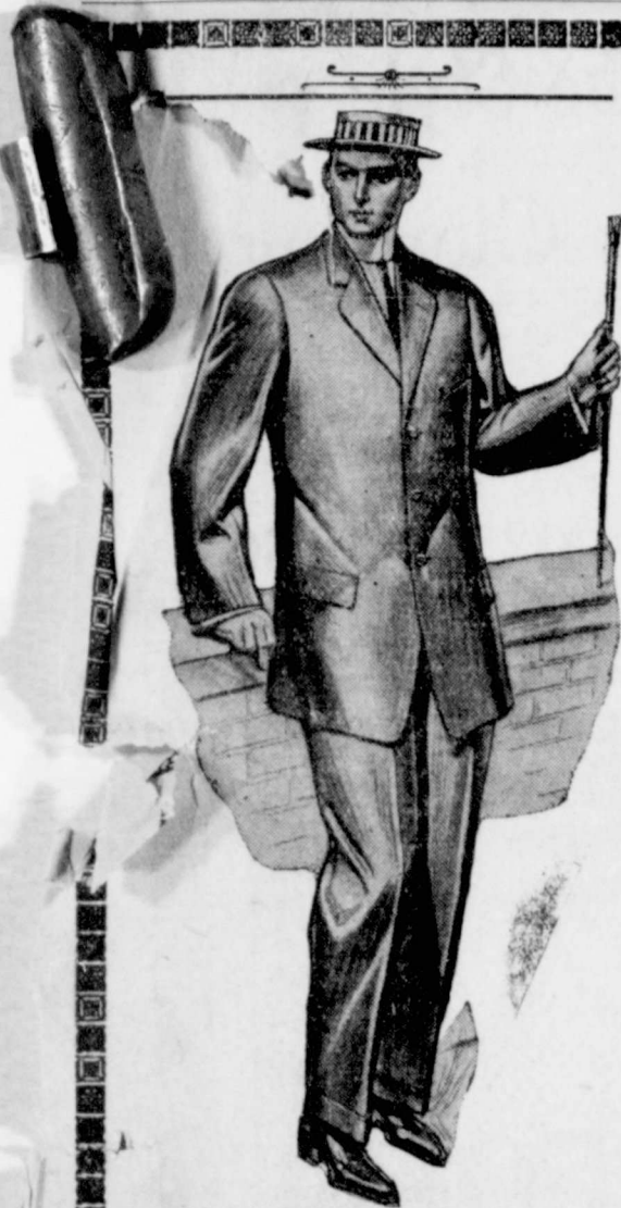
DESIGNED BY SPERO, MICHAEL & SON NEW YORK