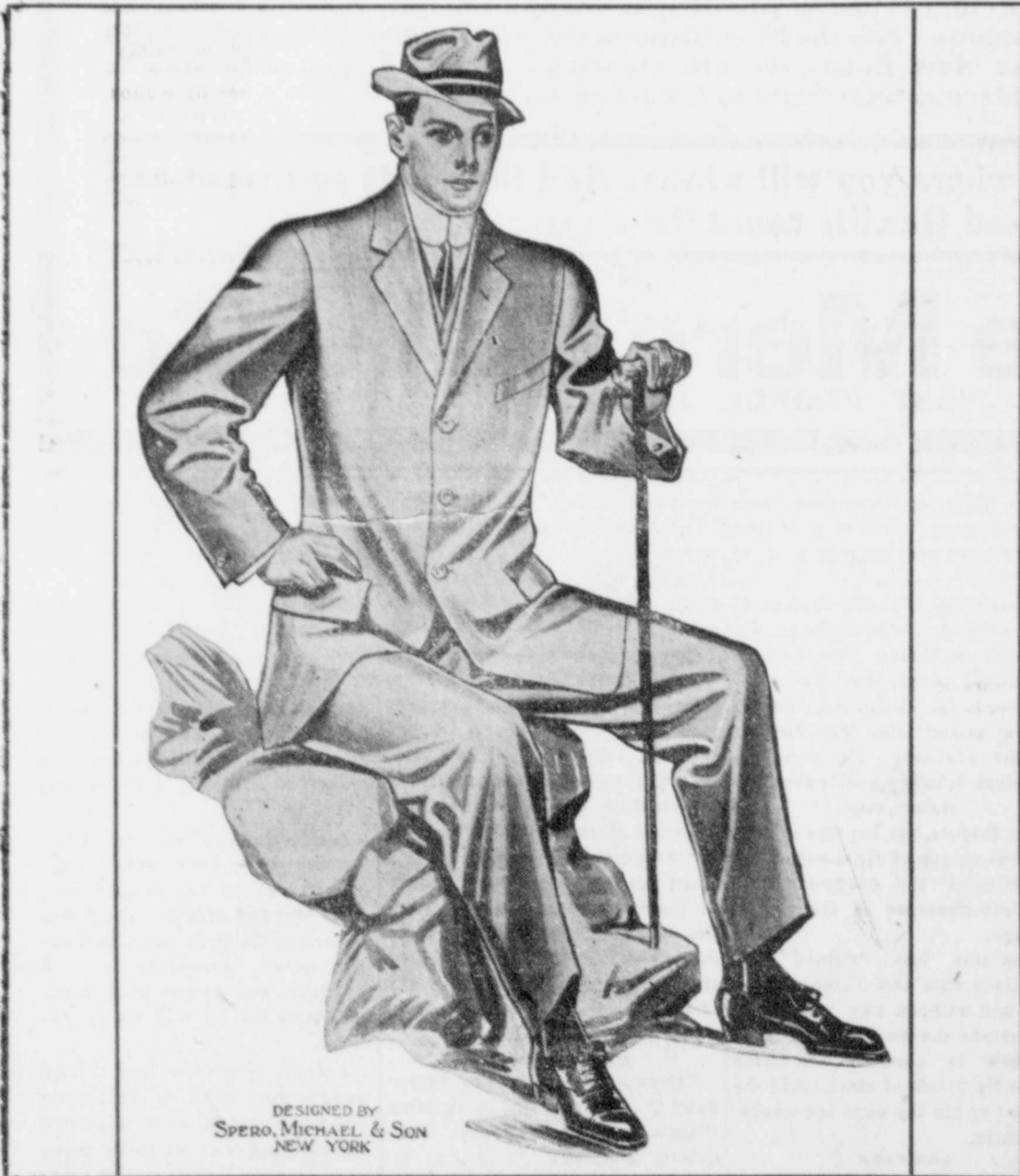
DESIGNED BY SPERO, MICHAEL & SON NEW YORK