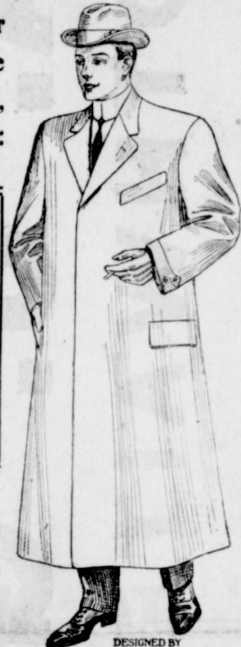
DESIGNED BY SPERO, MICHAEL & SON NEW YORK

You will find in our Store everything to be carried in any first-class Dry Goods Store anywhere in Texas. These Goods are always selected with the best of care, and at the same time sold at the lowest Cash Price.