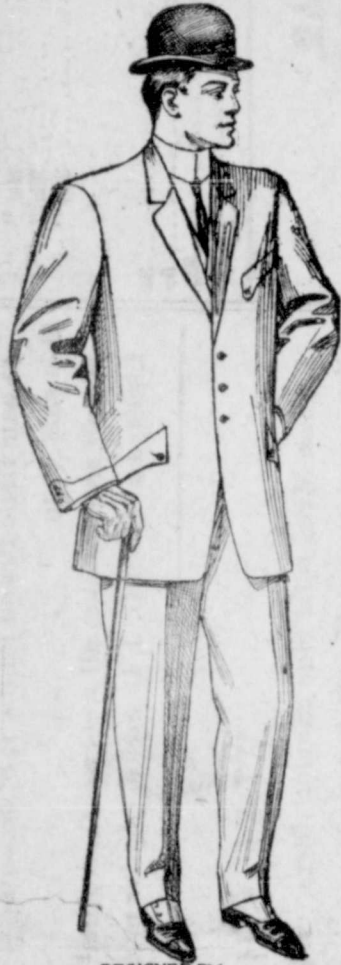
DESIGNED BY SPERO, MICHAEL & SON NEW YORK

You want to get some Suitable Christmas Presents for your Relatives and Friends. You can find among the many beautiful things we are showing, Practicable, Seasonable Presents for the entire family. :: ::