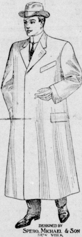
DESIGNED BY SPERO, MICHAEL & SON NEW YORK