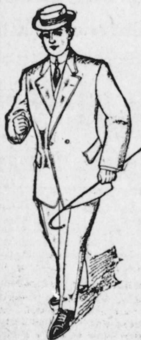
One-Button D. B. Novelty Sack, 485; vest cut to show above coat lapels

We will only charge $25 to $40 for a suit tailored to fit your form, and guaranteed to be the quintessence of all that is perfect in modern clothes construction.