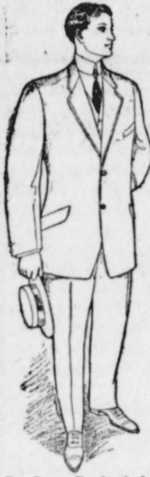
Two-Button Novelty Sack, 491; vest cut to show above coat lapels

What have Tailors? MADE BY ED. V. PRICE & CO.