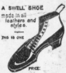
A SWELL SHOE made in all leathers and styles. THIS IS ONE.

They are all coming to the Walk-Over shoe for style, durability, etc. We carry several styles, you'll find them right prices $3.50 to $5.00.