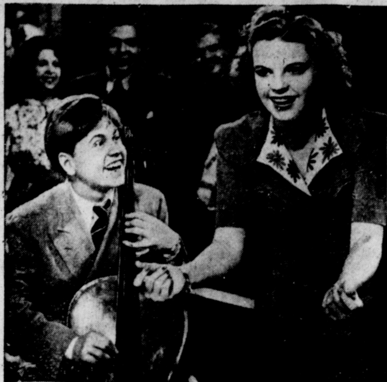
Mickey Rooney and Judy Garland in "Babes in Arms"

Rooney's scenes in "Babes in Arms" that closely parallel his own life. As Mickey Moran, in the picture, he is the son of a vaudeville performer and is born backstage at the Palace theatre in New York during a performance. Mickey really is the son of Joe Yule, former vaudeville, and, although not actually born backstage, he spent most of his infant life in stage dressing rooms and in the wings as his dad performed.