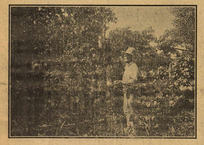
"TERRY COUNTY PEACHES"