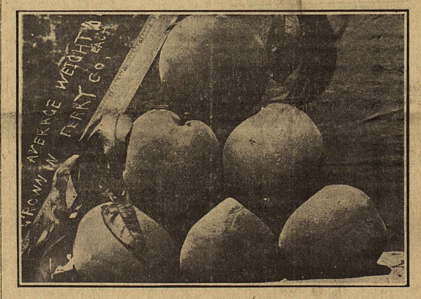
SOME TEN AND TWELVE OUNCE ELBERTA PEACHES

and begin bearing well the third Those shown in this photo year, and once well started, we