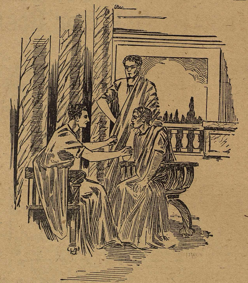
THE ROMAN TRIUMVIRATE.

ULIUS CAESAR, Crassus and Pompey formed a triumvirate which ruled Rome and reaped a rich harvest off Roman civilization. It was the most powerful political faction known in human history. It destroyed the confidence of the people in the government and hastened the downfall of Rome, which resulted in plunging the world into the dark ages. Factions are always formed to reap, they never sow, and while disbursing one class of property among all others, they levy a heavy tribute for their labors. A pooling of political power is the most dangerous trust that was ever formed in ancient or modern civ-