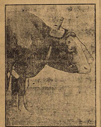
AT BOME, GA.

For the small farmer as well as for the man who farms on a larger scale I believe oxen are well nigh indispensable on a New England farm, says a Connecticut woman correspondent of the Rural New Yorker. If a man cannot afford as large and heavy a team of horses as he needs he will do well, instead of buying a cheaper span of horses, to invest in a yoke of working cattle, with a horse for driving besides. The oxen will do all the heavy work and do it well, for, although they are slow, they are sure. The horse can be used for work that the oxen cannot do, such as on the mowing machine, rake, cultivating, etc. In our hill country oxen are constantly proving their value. One large farm has the story of the great writer's brother, two yoke of cattle, which haul all the wood from the woods over rough, stony lands and apologetic roads. They also haul heavy loads of grain and