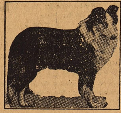
FINE SPECIMEN OF COLLIE

Tip on Sheep Dog Training. Training a young sheep dog which never had the benefit of seeing an older dog at work is a difficult business. It is best to teach a dog when he is young. If possible let him have a run with an old dog at the game, but check any inclination to play. If you have no opportunity to let a young dog learn something of the early tricks of sheep driving it is best to begin determinedly with him at home. The first lesson is obedience, of course. and right on top of that get him into the habit of lying down when told. If he will not lie down and stay there