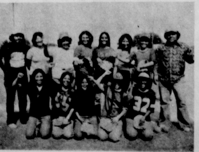
St. Judes Softball Team