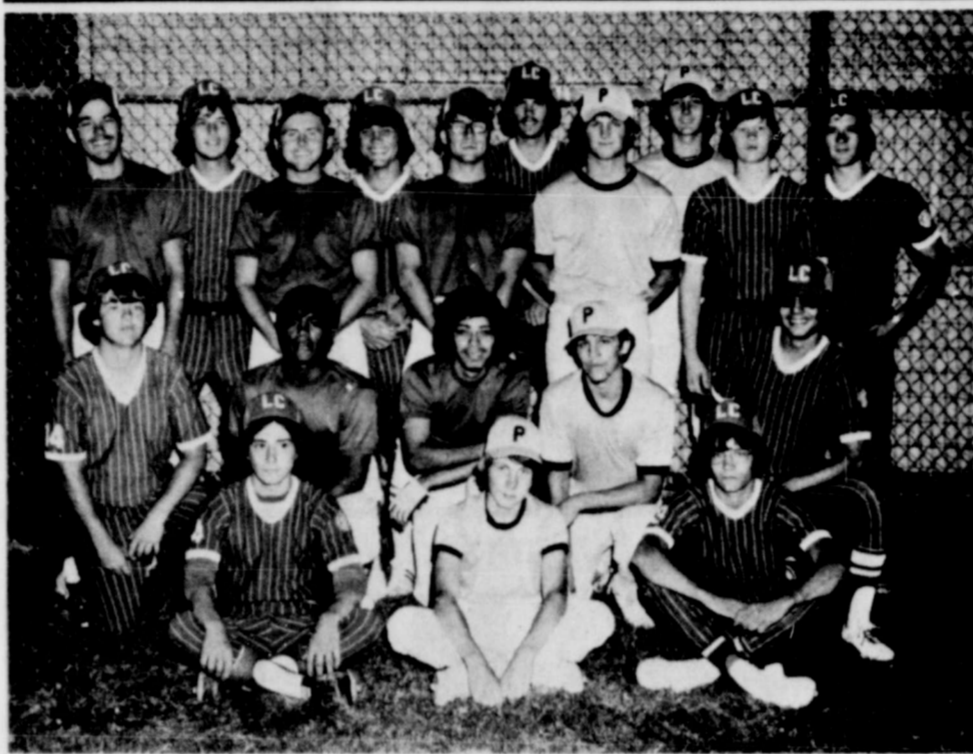
1975 SOUTH PLAINS BABE RUTH ALL - STARS

The Tahoka High School football players will be issued shoes August 6. August 11, workouts will begin in shorts and socks. A letter will be out to the players the week of August 4th telling what date they are to report for physicals.