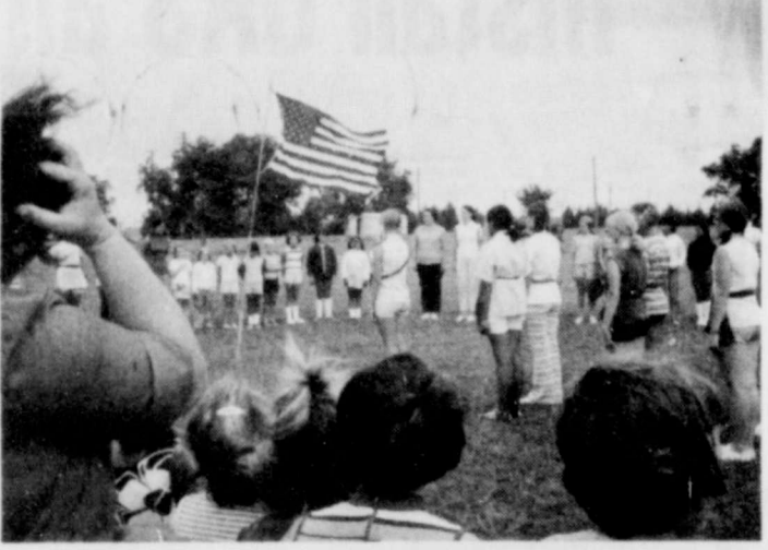
CLOSING FLAG CEREMONY ENDS THE DAY AT CAMP.

these units the girls learn the basic skills of camping and participate in nature and conservation activities. They wil! also learn crafts, act out stories, and play games. The older girls will be working toward earning badges.