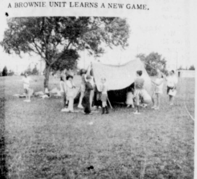
JUMOR GIRL SCOUTS PUTTING UP THEIR TENT.