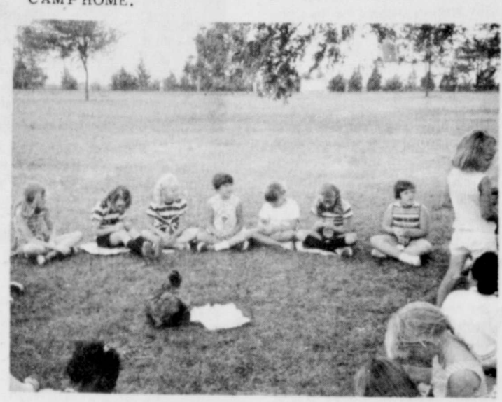
A UNIT OF BROWNIES WORKING ON MAKING MINIATURE FIRST AID KITS.