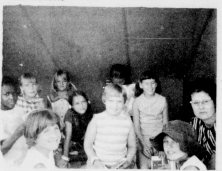
A UNIT OF JUNIOR FLY-UPS IN THEIR TENT.