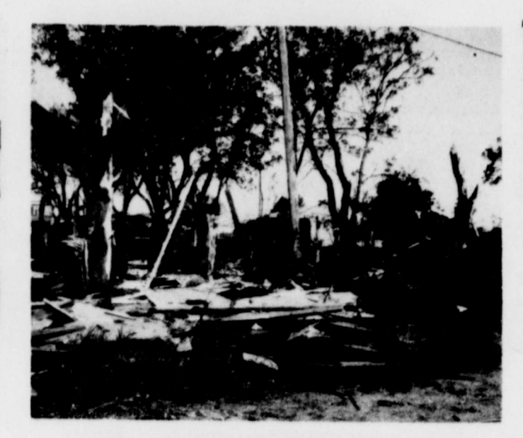
TYPICAL TORNADO DAMAGE—This picture is typical of tornado-struck areas, showing the debris scattered about as well as the twisted torn trees in the path of the tornado. This News photo was made Saturday in the northeast part of Crowell.