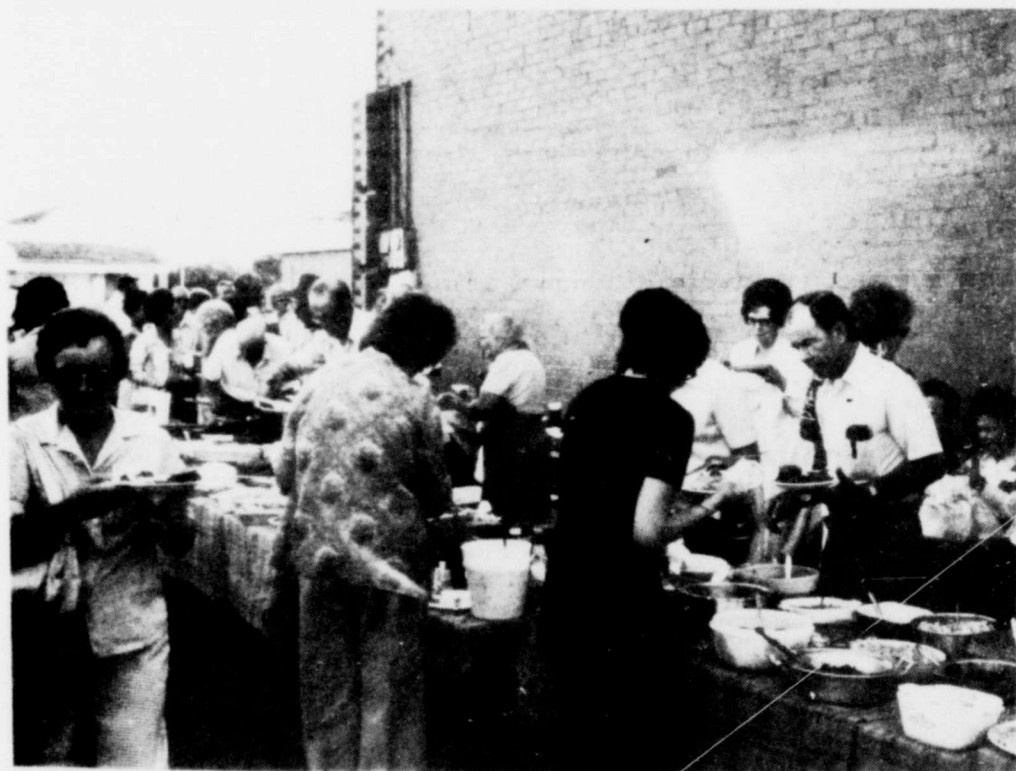
PLENTY OF FOOD—Lots of people were on hand at Truscott Saturday night for the reunion and musical. Women of the