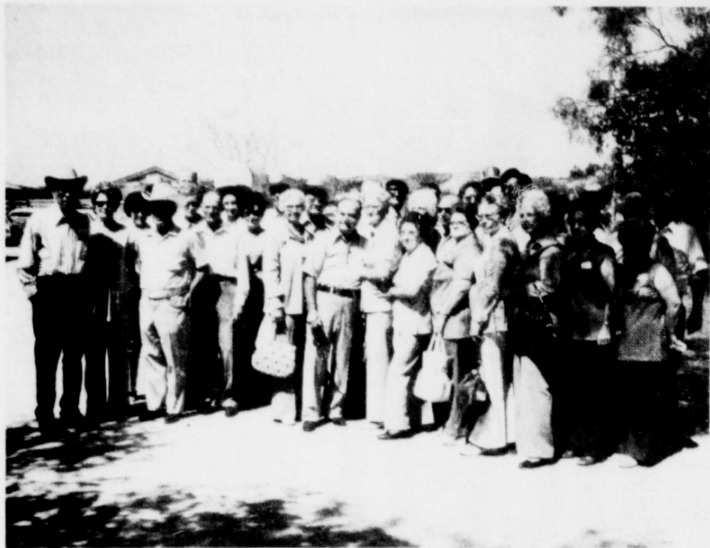
VIVIAN REUNION VISITORS—This large group of present and former residents of the Vivian community posed for picture