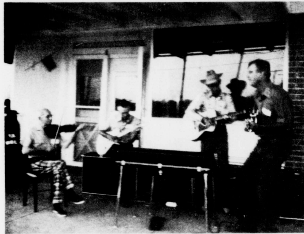
MAKE MUSIC—These four men were among those performing at the reunion and musical at Truscott Saturday night. Paul