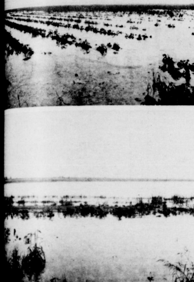
FIELDS UNDER WATER—These two pictures above give a view of some of the water in the Rayland community following heavy rains recently. In the top picture are tall stalks of cotton almost covered by the high waters. The lower picture is a flooded field. These pictures were made just west of Rayland Friday afternoon, September 4.