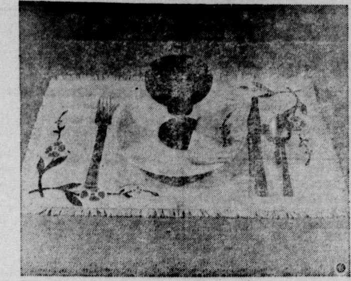
STENCILED PLACE MAT—One of the simplest of decorative arts is stenciling, a fascinating craft currently enjoying a surge of popularity. It's an old method of transferring designs to furniture and fabrics. A red and green flower motif has been stenciled on this yellow cotton place mat and napkin.

The FBI says over 1,828,000 burglaries were committed in the United States in 1968, with average loss per burglary of $298. To-tal dollar loss of approximately